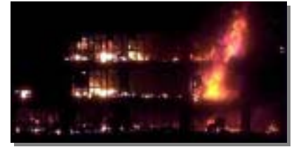
Disaster strikes AnexTEK offices

A month prior to the fire, AnexTEK had signed an agreement with FalconStor to integrate FalconStor's IPStor software into AnexTEK's storage solutions product line and offer it as a new product called IPSNS: IP-based Storage Networking Solutions. After receiving a beta version of IPStor, AnexTEK's engineers began installing and